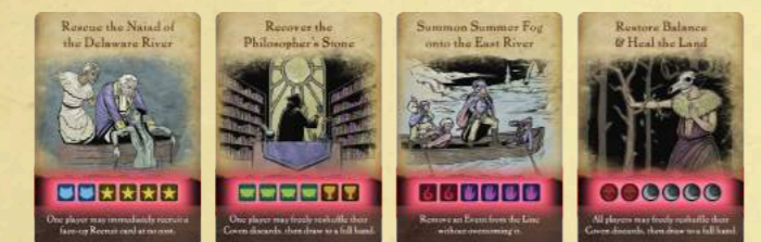
Sample set of four Objective cards, one of each type. Types are distinguished by their icon pairs.